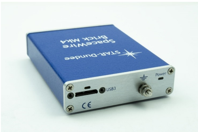
SpaceWire Brick Mk4 Rear Panel