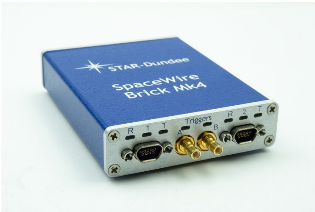
SpaceWire Brick Mk4

The SpaceWire Brick Mk4 provides two SpaceWire interfaces, support for high speed data transfer, the capability to inject various types of errors on demand, the ability to transmit and receive time-codes and act as a time-code master, and comes complete with highly optimised host software for low latency transmission of SpaceWire packets directly to and from the host PC.